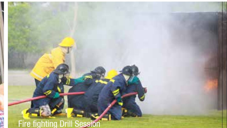
Fire fighting Drill Session