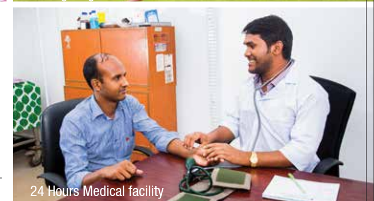
24 Hours Medical facility

To cope with the ever-changing demands and technologies it regularly arranges on-the-job and off-the-job trainings to maintain a flexible workforce.