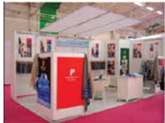
Tex World : Paris, 2010