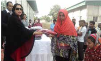
Winter Clothes Distribution among Workers