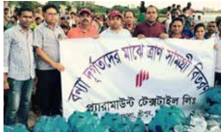
Relief Distribution to Flood Affected