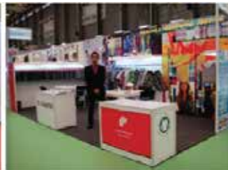
Tex World : Shanghai, 2012