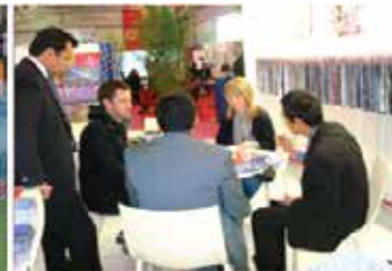
Tex World : Paris, 2012

Paramount Textile leaves no stone unturned in engaging with its workforce and empowering them. Housing facilities, health checkup, opportunities for participation through workers