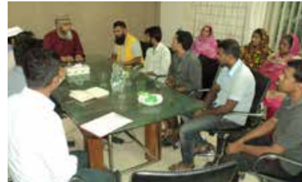
Workers Participation Committee Meeting