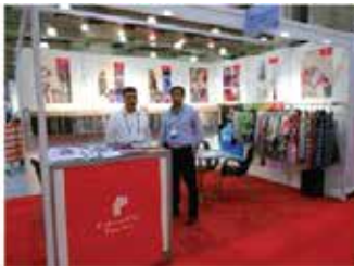
Tex World : New York, 2011