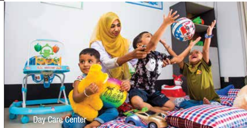
Day Care Center